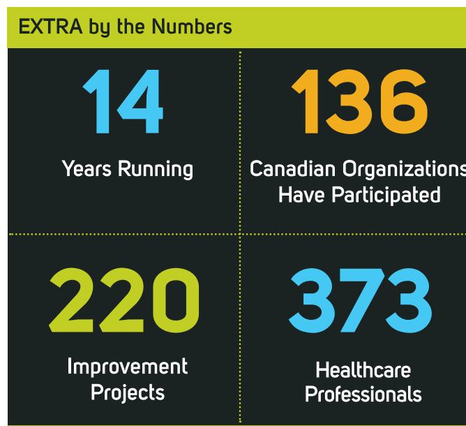
Figure 1: EXTRA by the numbers

of EXTRA Cohort 11 teams report that their improvement project has led to changes in their organization's culture.